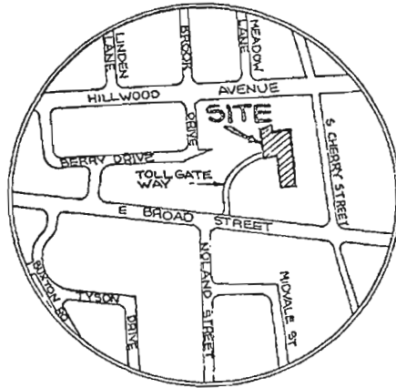
VICINITY MAP SCALE 1"=500'